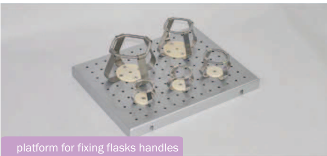
platform for fixing flasks handles

Universal platform for various kinds of vessels, with 4 roller clamps.