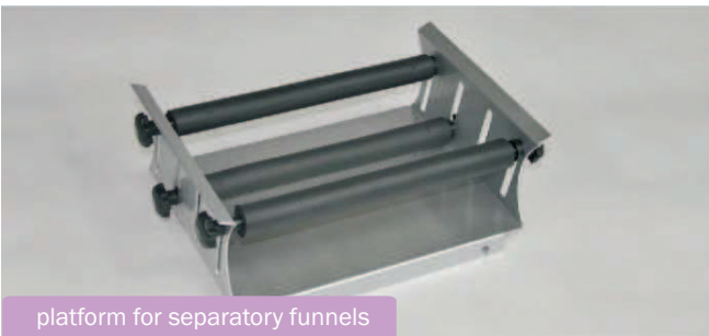
platform for separatory funnels

Platform for shaking Petri plates, bacteria culture flasks and other vessels of low centre of gravity.