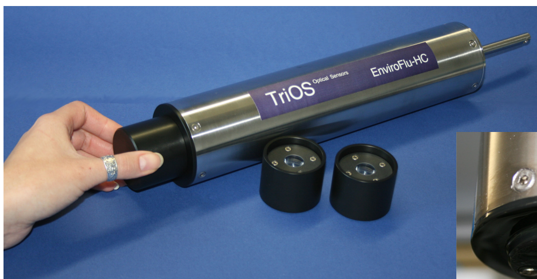
enviroFlu-HC with SolidCAL-HC solid secondary standard