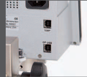
Rear view to the viscometer showing the new USB interface that provides a faster transfer of data to the computer.