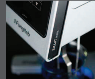
Easy identification, on your first look at the equipment, you identify it.