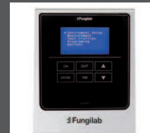
Front view of the viscometer, touch keyboard with 6 keys and graphic display.